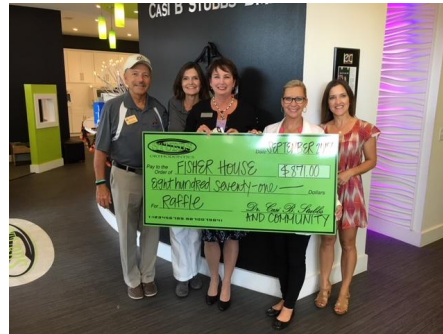
Stubbs Orthodontics - $871