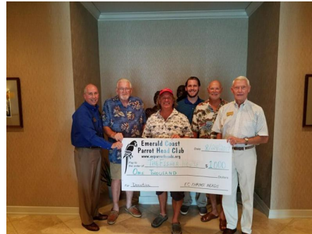
Emerald Coast Parrot Heads - $1,000