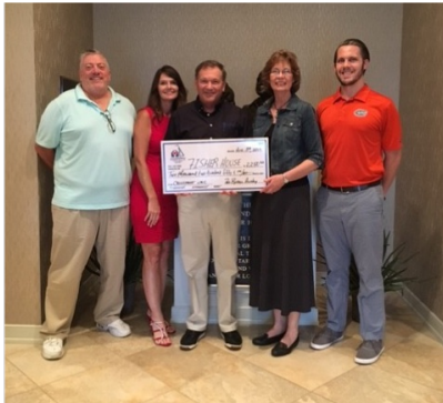
CrossPoint United Methodist Church - $2,250

Boy, have we been blessed with some busy for the past few months.....lots to catch up on and all the news from our generous friends and family is NOTEWORTHY . We would like to recognize some of our cause champions and financial partners for the past several months. When you see them, please thank them for their help fulfilling our mission.