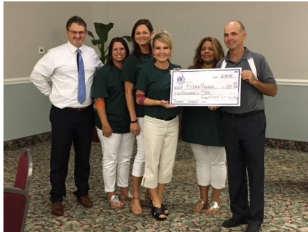
Angels Care Home Health - $1,500